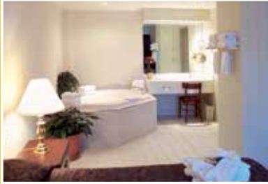
Holiday Inn Express Hotel & Suites LaMalfa

Beautifully Appointed, Affordable Accommodations