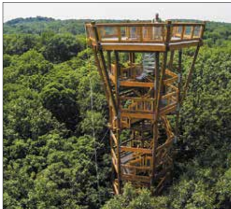
The Holden Arboretum's 120 Foot High Emergent Tower overlooking 3,600 acres